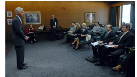
Governor Charlie Crist speaks with 2009 TIP students.

contact with the student and the official to guarantee that the goals of the internship program are being achieved. Each student will spend five days per week in the official's Tallahassee office, for which he/she will earn six credits. In addition, the academic foundation for the internship will be provided by a three-credit Tallahassee seminar that will meet in the Capitol at a time specified, and there will be three credits for a compressed course to be offered on the Tampa campus during the weeks before the legislative session begins. Thus, students who complete the program will have the opportunity to earn a total of 12 credits in the USF Tallahassee Intern Program. Students are responsible for tuition and fees in accordance with USF policies. Students also are responsible for transportation to the state capital and expenses they incur during the program. Students are awarded a $2,500 stipend from the USF Alumni Association in partnership with USF Student Government and the USF College of Arts & Sciences, and an additional $1,000 scholarship from the H. Lee Moffitt Scholarship Fund. The stipend is intended to defray expenses while participating in the program.