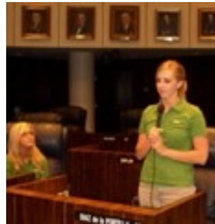
Spring 09 LIP students hold mock debate in Senate Chamber.

through the entire legislative session from committee meetings to the final days of session, reflecting upon your experience in academic journals, and then completing a major research paper based upon your participation in the process. USF Alumni Association Council of 100 members serve as mentors during the Capitol visits and introduce students to key individuals who may have a stake in the outcome of particular bills related to your issues. Each student selected receives a $500 scholarship from the Alumni Association to defray lodging and travel costs to Tallahassee.