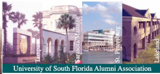
Life Member Card